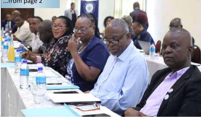
Workers Representatives following the presentations during the Fourth Quarter Consultative Workshop.