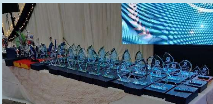
PSC Glass Shields and Trophies for 2024 Award Winners.

The Awards Ceremony featured several categories, including the Outstanding Chairman's Award, the Exceptional Leadership Award, and the Secretary's Award. Winners were selected based on their outstanding contributions, innovative ideas, and commitment to excellence. The ceremony also included another plethora of awards for staff members who have demonstrated exceptional dedication and service to the Commission.