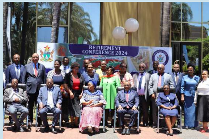
Honourable Ministers, Chairman to Service Commissions, Commissioners and Senior Government Officials pose for a picture at the Retirement Conference at HICC.

Convening with experts in the retirement sector, the conference sought to ensure that retirement is not an end-point but a meaningful new chapter contributing to the prosperity of provinces, districts and communities at large.