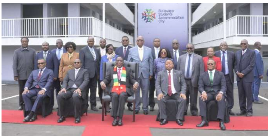
His Excellency, the President Dr E. D. Mnangagwa, Honourable Ministers, Commissioners, and Senior Government Officials at the Bulawayo Students Accommodation City launch.