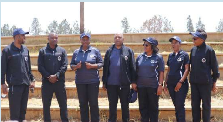
The Inter-Ministerial Sports, Arts and Culture Organising Committee in the Public Service Commission.

Finally, the Inter-Ministerial Games in Gweru gave a much-needed platform for promoting and revitalising the wellness initiative. PSC attendance was not only beneficial to the organisation, but it was also a welcome addition to the MDA family during the festivals. The secretariat took the lead and inspired the other MDAs to adopt a more rigorous and tactical approach to wellness. The four-day event successfully encapsulated the overall concept of wellbeing, but in the future, the event would benefit from a few additional days and some more thorough planning. It was evident that the PSC's leadership in the event was highly valued. As such the Commission recommended more purposeful engagement entailing a robust coverage and visibility. Charity begins at home, thus PSC may