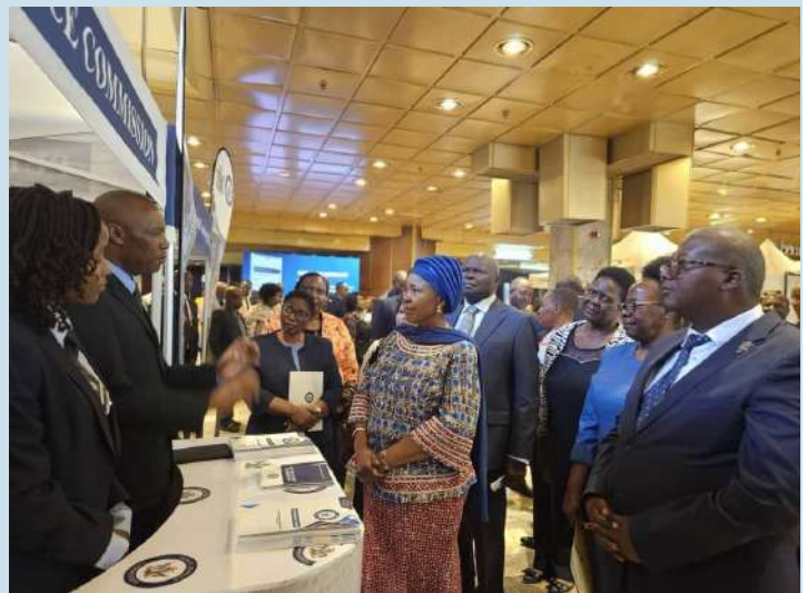
Honourable Ministers, Commissioners and Government Officials during their tour of PSC Stand during the Retirement Conference at HICC.