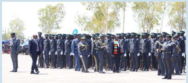
The President of the Republic of Zimbabwe, His Excellency Dr E.D. Mnangagwa during an inspection at Pass-out parade in Ntabazinduna, Bulawayo.