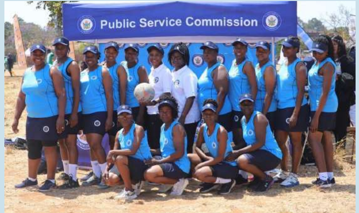
PSC Netball Team posing for a picture at the PSC Stand during Sports and Athletics Competitions.

man's Cup,' and then throw a Government-wide festival; one can only dream. In his keynote address, Honourable Minister Moyo reiterated the government's commitment and promised to make future events like this one bigger and better.