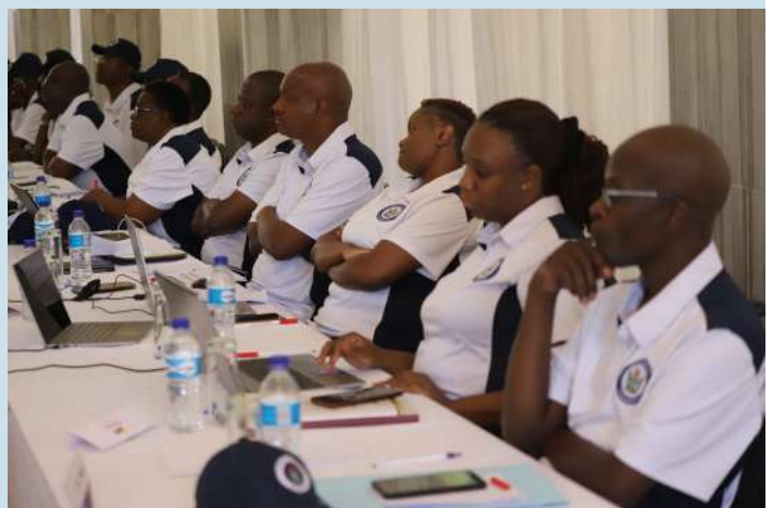
PSC Secretariat staff following proceedings during the Strategic Plan Review Workshop in Masvingo.

The workshop marked a significant milestone in the PSC's journey towards achieving its vision and objectives. As the PSC embarks on implementing its strategic plan, it is clear that the year 2025 will be marked by significant reforms and improvements in the public service. The PSC is poised to play a critical role in shaping the public service and contributing to the country's development agenda. With its strategic plan in place, the PSC is well equipped to address the challenges and opportunities that lie ahead, working in collaboration with its stakeholders to achieve common goals and promote the well-being of citizens.