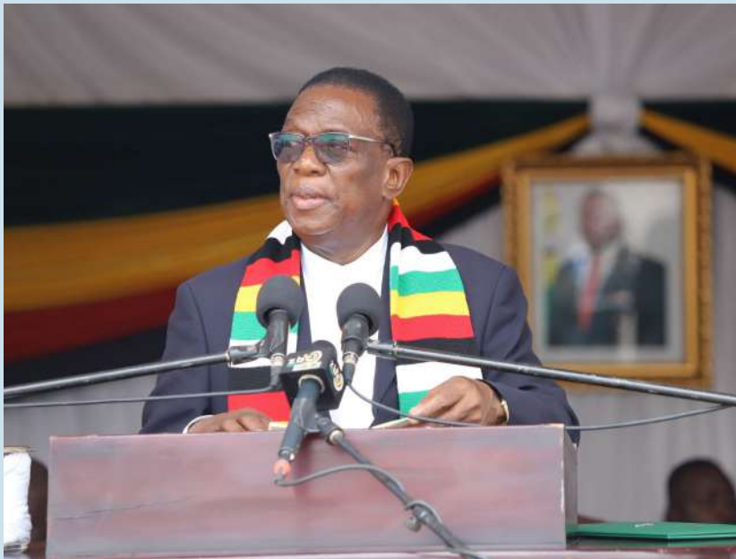
The President of the Republic of Zimbabwe and Commander in Chief of the Zimbabwe Defence Forces, His Excellency, Dr E.D. Mnangagwa at the Pass-out parade at Ntabazinduna Prisons Training School in Bulawayo.

On December 16, 2024, His Excellency Dr. E.D. Mnangagwa, President of the Republic of Zimbabwe and Commander-in-Chief of the Zimbabwe Defence Forces, officiated at the combined 154th and 155th Pass-Out Parade at Ntabazinduna Prisons Training School, where he conferred certificates to 1,619 Recruit Correctional Officers. The graduating cohort comprised 1,106 males and 513 females, who are now poised to play a vital role in the rehabilitation and reintegration of of-