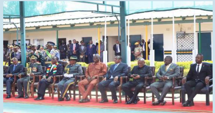
His Excellency, Dr E.D. Mnangagwa, Honourable Ministers and Senior Government Officials at the Pass-out Parade in Ntabazinduna.

The Public Service Commission plays a critical role in human capital development and management to address the skills gaps. The Uniformed Services and Commissions continue to develop and manage a competitive, equitable and sustainable remuneration system for the Uniformed Forces and Independent Commissions.