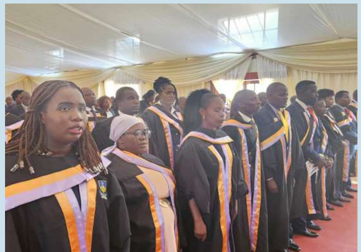
Graduands at Domboshava Training Institute Graduation Ceremony singing the National Anthem.

With a current enrolment of 112 students, Domboshava Training Institute as one of PSA’s 14 campuses is witnessing steady growth, buoyed by its production of skilled and fit-for purpose graduates. The reform based mandatory courses that are provided at all the campuses of the Public Service Academy aim at empowering a public service that is moving in step with the developmental and modernisation imperatives of Government.