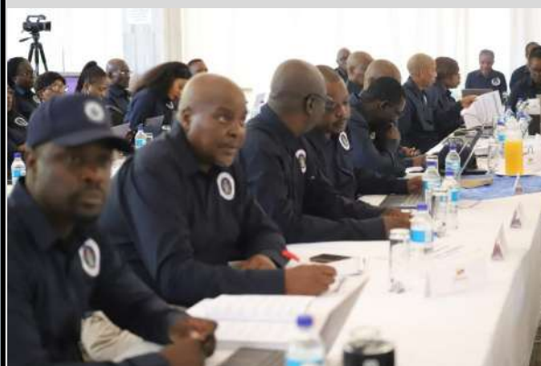
PSC Secretariat members at the Strategic Plan Review Workshop in Masvingo.

Public Service Commission's 2024 Strategic Plan Review Workshop was held in Masvingo, with all stakeholders fully represented. It was a thorough "stock-taking" event aimed at interrogating what was achieved and what was missed in 2024 and; how any identified gaps were plugged as well as challenges addressed to enable the organisation effectively contribute towards the attainment of Vision 2030.