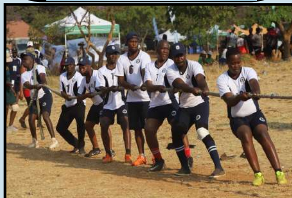
PSC Tag of War Team at the Inter-Ministerial Sports Competitions in Gweru.