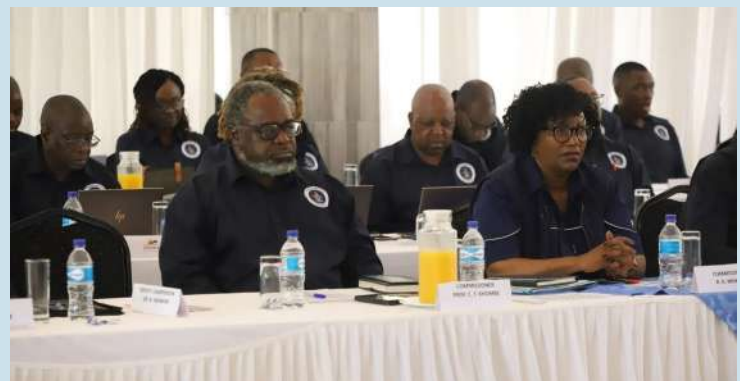
PSC Commissioners and other Senior Management members during the Strategic Planning Review Workshop at Clevers Hotel, in Masvingo.

Honourable Moyo went on to highlight that it is indispensable for the Commission to be visible on the ground as it positions it to best assess the needs of the people in order to deliver citizen centred needs at a time when the Government is striving for a citizen centric, responsive and future ready public service.