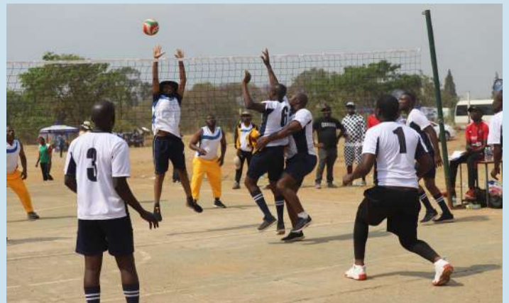
PSC Male Volley Ball Team during a match against Ministry of Home Affairs.