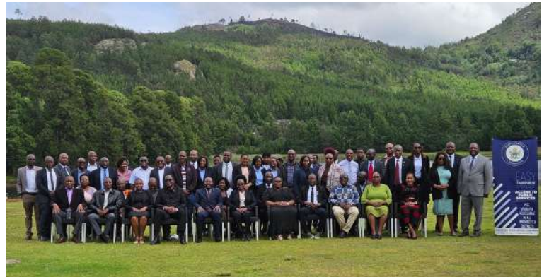
Group photo of Government Workers and Worker's Representatives at the Fourth Quarter Consultative Workshop in Nyanga.

The Public Service Commission Consultative Workshop marked a significant milestone in the quest to elevate worker welfare in Zimbabwe. As stakeholders continue to converge around this shared objective, the prospects for a more harmonious and productive public service delivery framework appear increasingly auspicious.