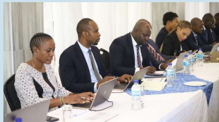
PSC Secretariat staff following proceedings during the Strategic Plan Review Workshop in Masvingo.