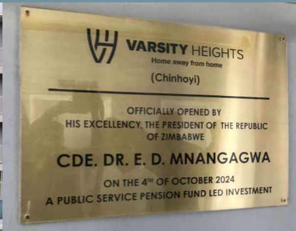
Chinhoyi Varsity Heights, a public service pension fund led investment officially opened by His Excellency, the President Dr E. D. Mnangagwa.