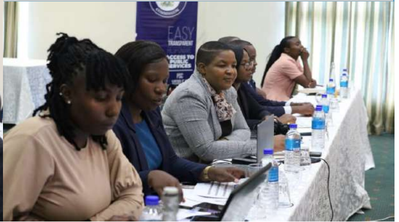
PSC Secretariat members following the presentations during the Fourth Quarter Consultative Workshop.