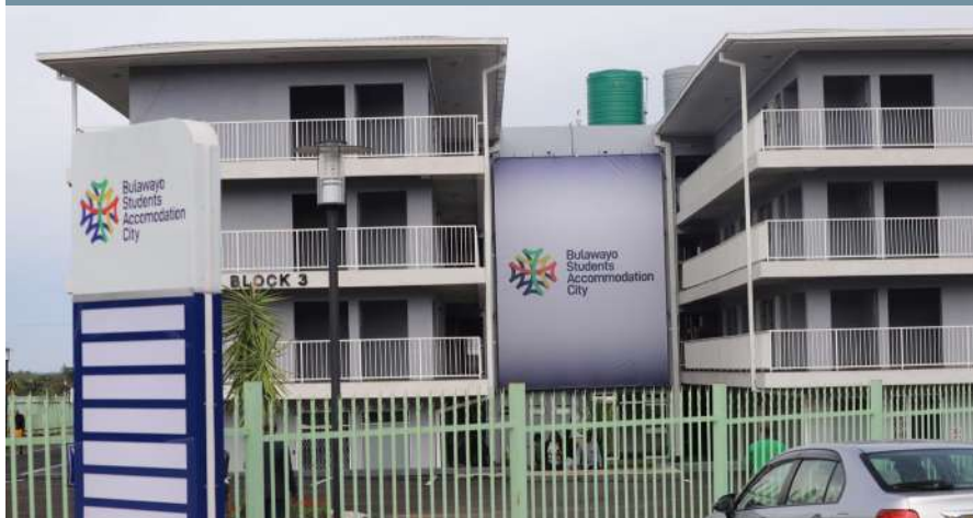
Bulawayo Students Accommodation City, the Public Service Commission Pension Fund Investment project.