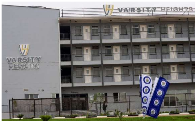
Chinhoyi Varsity Heights, a PSC Pension Fund Investment project in pictures.