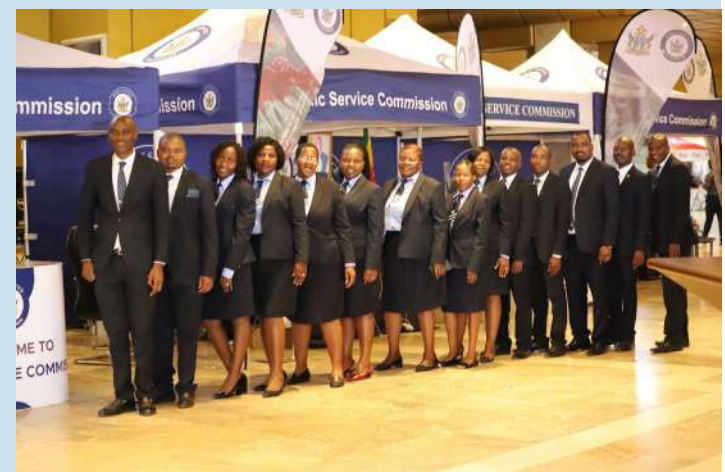
PSC Retirement Planning Conference Exhibitors posing for a picture at the PSC Stand. HICC