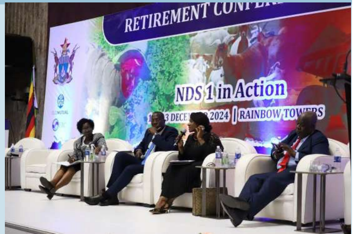
Panellists from different organisation during discussions with the audience at the Retirement Planning Conference.

Currently the government is catering for around 200 000 retirees benefiting from the pension payouts, and every year 300 to 500 civil servants retire from the public service. With these worrying statistics, it is of paramount importance to empower and educate public servants on ways to secure a good life after retirement.