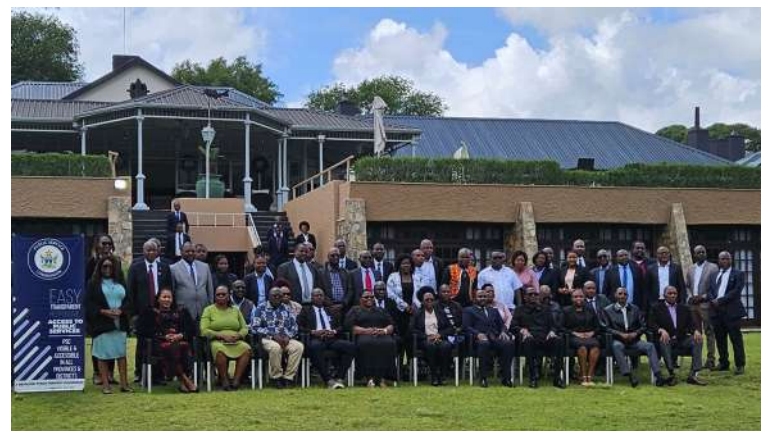
Government Workers and Workers' Representatives who attended the Fourth Quarter Consultative Workshop Troutbeck Hotel