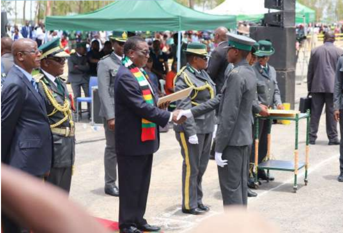
The President of the Republic of Zimbabwe and Commander in Chief of the Zimbabwe Defence Forces, His Excellency, Dr E.D. Mnangagwa at the Pass-out parade at Ntabazinduna Prisons Training School in Bulawayo.

In his speech, His Excellency President E.D. Mnangagwa encouraged the new recruits to embrace new technology in their day-to-day execution of various duties as technology enhances effectiveness and efficiency in service delivery. “The appropriate use of technology in the correctional domain can significantly enhance security efficiency, management and rehabilitation efforts. In this regard as Correctional Officers there is need to adopt new technologies and smart prison concept in the discharge of your duties” he said.